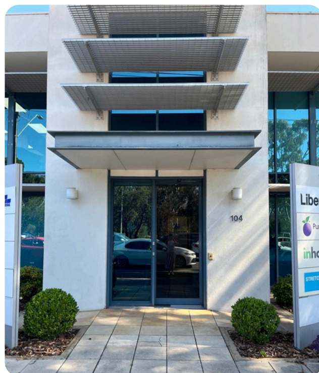
Image: front entrance with automatic sliding doors.

If the door is locked, press the red doorbell on the right.