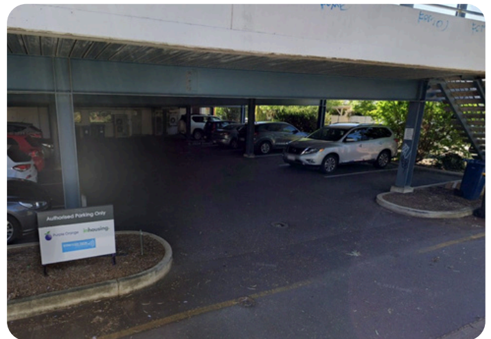
Image: back of building drop off. Our car park is on the road level.