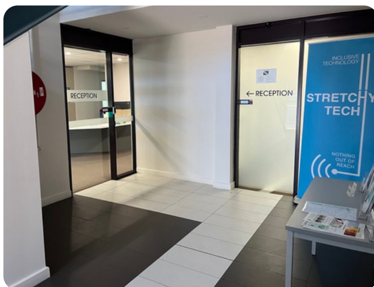
Image: inside the foyer of the building. The reception is through the see through glass door on the left.

Press the black door bell on the right side of the automatic sliding door. Reception hours are 9am to 5pm.