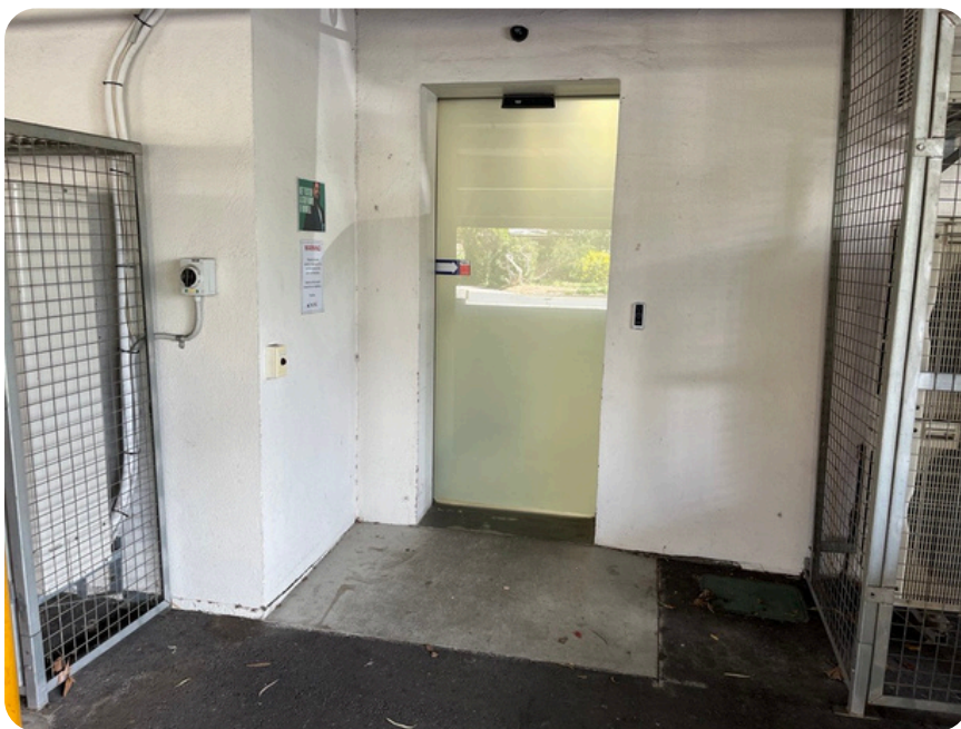
Image: back door entrance off Park Lane.

You can gain access by pressing the black doorbell on the wall to the right during business hours, or the red doorbell on the left after hours. You may not hear the doorbell. A staff member will come to the door to let you in.