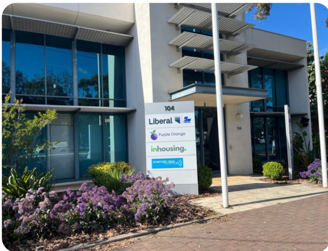
Image: front of building entrance is a white building with glass windows. Sign out the front with 3 of our businesses logos. Sign also has the logo of the other business located in the same building.

The office is close to the Greenhill Road tram stop and various bus stops.